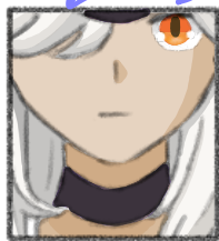
Cyno (small coloured section)

eye: outlines excluding top have been erased + white and light orange highlights using pencil at the bottom of the iris